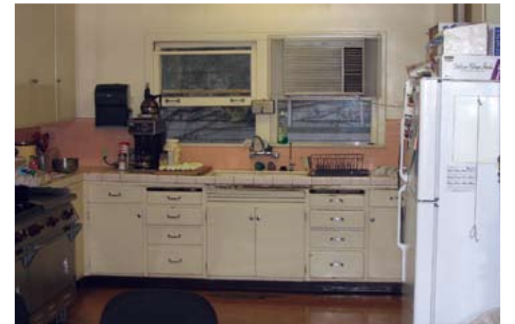
Above: The old kitchen, last year. Below: The same kitchen after completion of renovation

On May 4, 2006, District 6 Councilman Tony Cardenas and the LA Fire Department opened the new facility with a special ribbon cutting ceremony. The Fire Fighters themselves celebrated with a terrific meal after the ceremony.